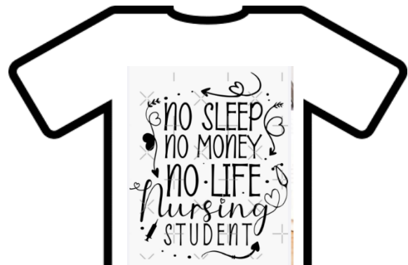
Style B: No Sleep No Money...