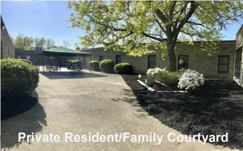
Private Resident/Family Courtyard