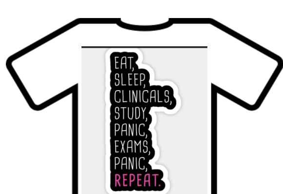
Style A: NO PINK Eat, Sleep, Clinicals...