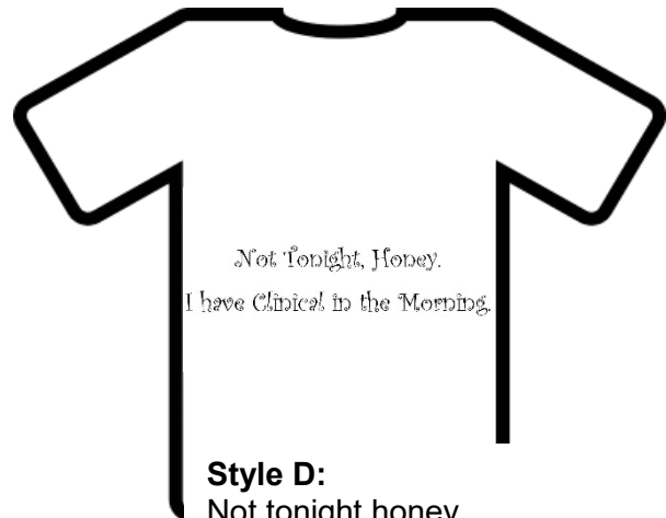
Style D: Not tonight honey...